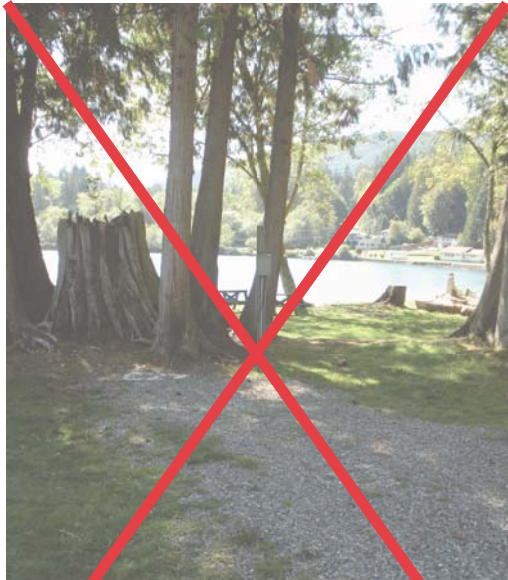
E27-Electrical only, Max 35' W/S, $2850 Great waterfront site, shade trees and good swimming/moorage access.