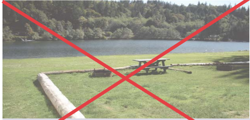
S4-Electrical only Max 35' W/S, $2850 Full sun, moorage right by your site. Great place to lounge and invite friends, come take a look to appreciate!