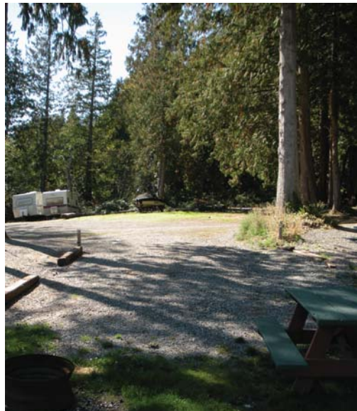
E39-Electrical only, Max 35' N/S $2400 Hot and Sunny, limited shade, great view of the lake.