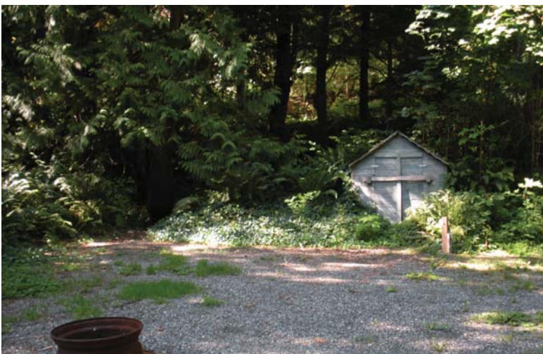
E65-Electrical & Water, Max 35' W/S, $2400 Large private site overlooking the lake, level/gravel & grass.