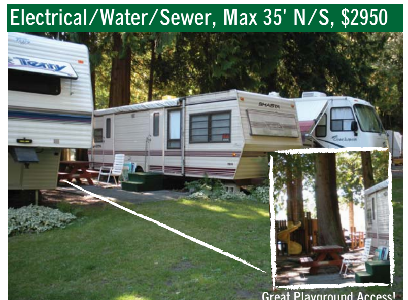
Electrical/Water/Sewer, Max 35' N/S, $2950