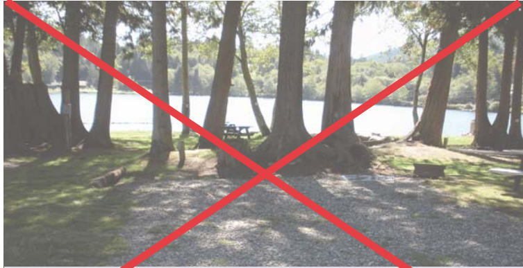
E28-Electrical only, Max 35' W/S, $2850 Spacious waterfront site, great swimming access and boat moorage closeby. Lots of sunshine and a few shade trees.